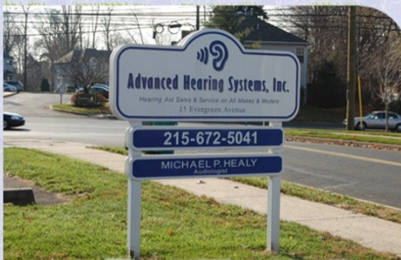
Convenient location in Warminster, PA

Hearing Loop Switch hearing aid to T-coil